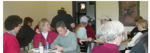
Some of the members enjoying the 2003 Social .